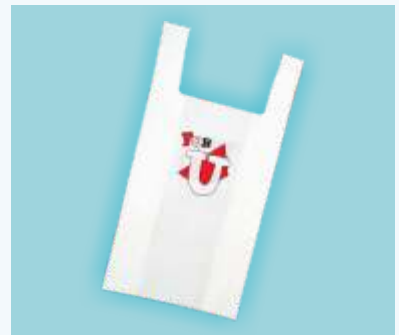
Reduces TiO 2 Master Batch