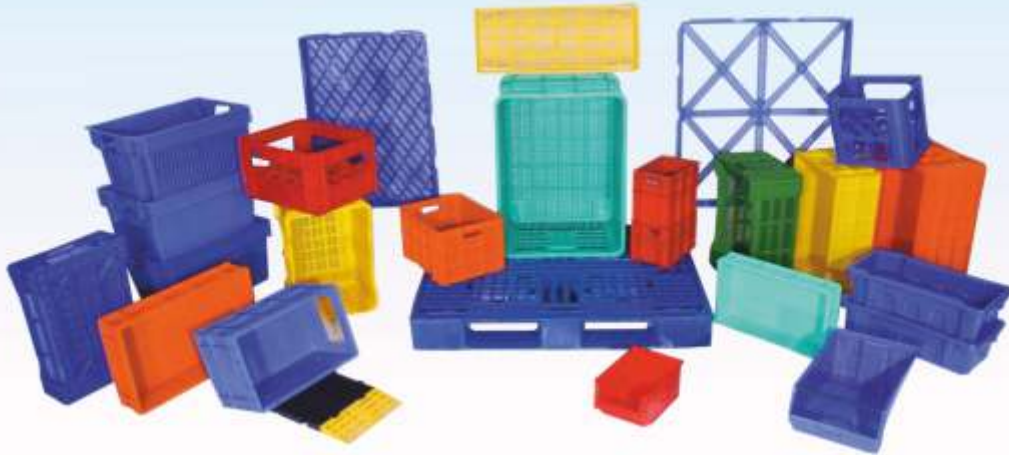
HDPE Injection Molded Crates & Pallet