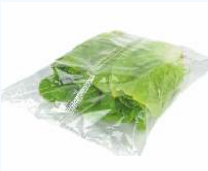
Vegetable Film Packaging