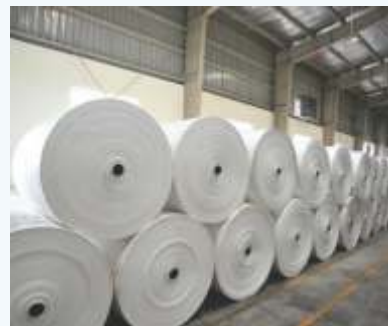
LOW DEBEIR PP FABRIC ROLLS