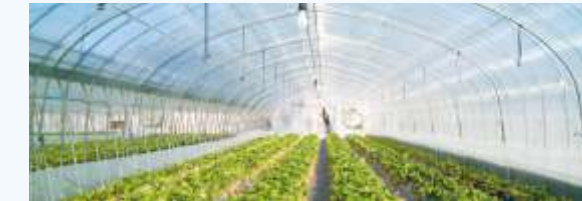
WOVEN GREEN HOUSE FABRIC