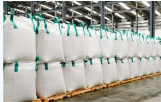
FIBC/ JUMBO BAG