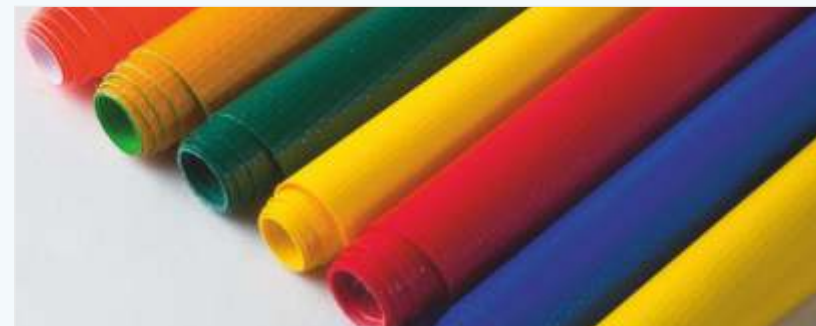
LAMINATED TARPAULIN FABRIC